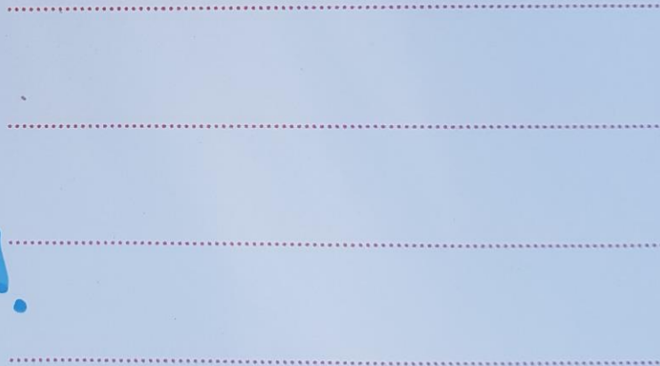
NELMA Free School Meals campaign postcard