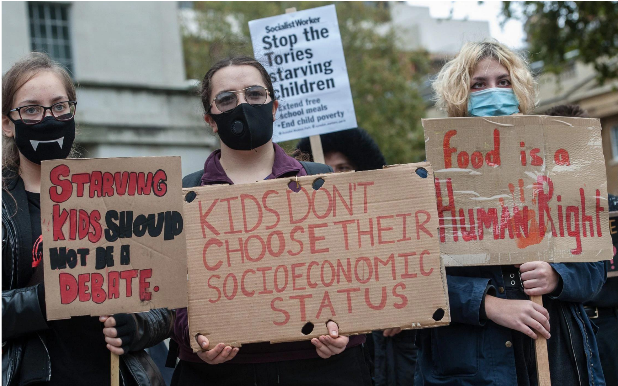
School students and educators protest outside Downing Street against the government decision not to extend free school meals during half term and the Christmas holidays