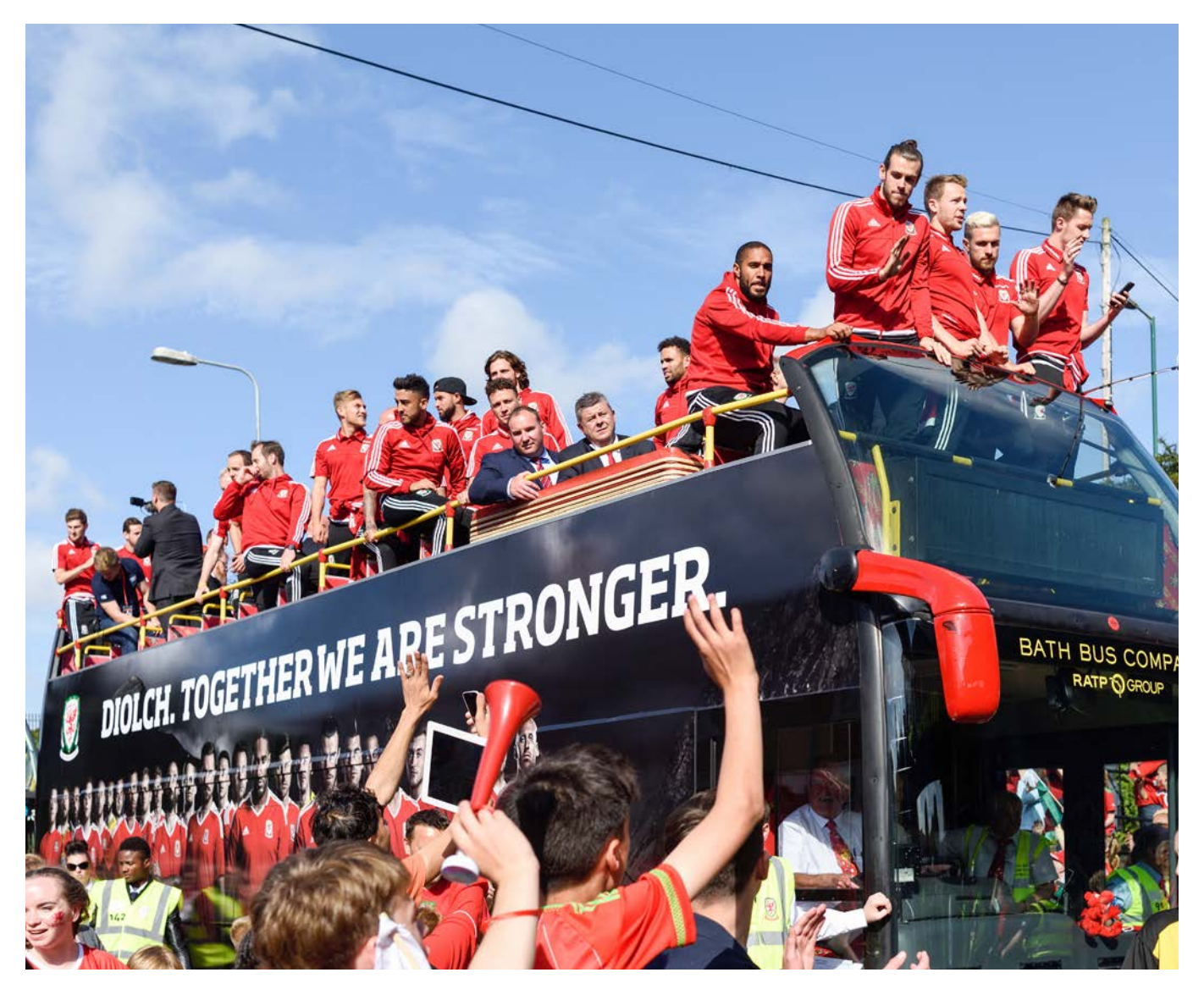
The Welsh football team receive a heroes' welcome in Cardiff after their historic run at the Euro Football championship. Cardiff, July 8th 2016.

This is positive news for Wales. There is plenty of best practice literature and policy on which to base the world's first sports diplomacy strategy for a devolved government.