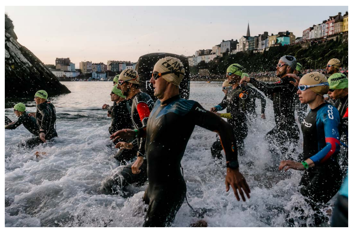
Ironman Wales. Tenby, September 2019