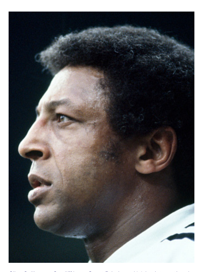
Clive Sullivan, a Cardiff born Great Britain and Wales international player. He became the first black captain of any national British sporting team when he was given the Great Britain captaincy and led the Lions to victory for the World Cup 1972. He went on to captain for Wales in 1975.

To investigate the feasibility of a Welsh sports diplomacy strategy, we first reviewed Welsh literature on the topic and collated practical examples of what might be termed Welsh sports diplomacy from the past and present. This exercise confirmed that Wales holds a veritable but largely untapped goldmine of sporting soft power assets.