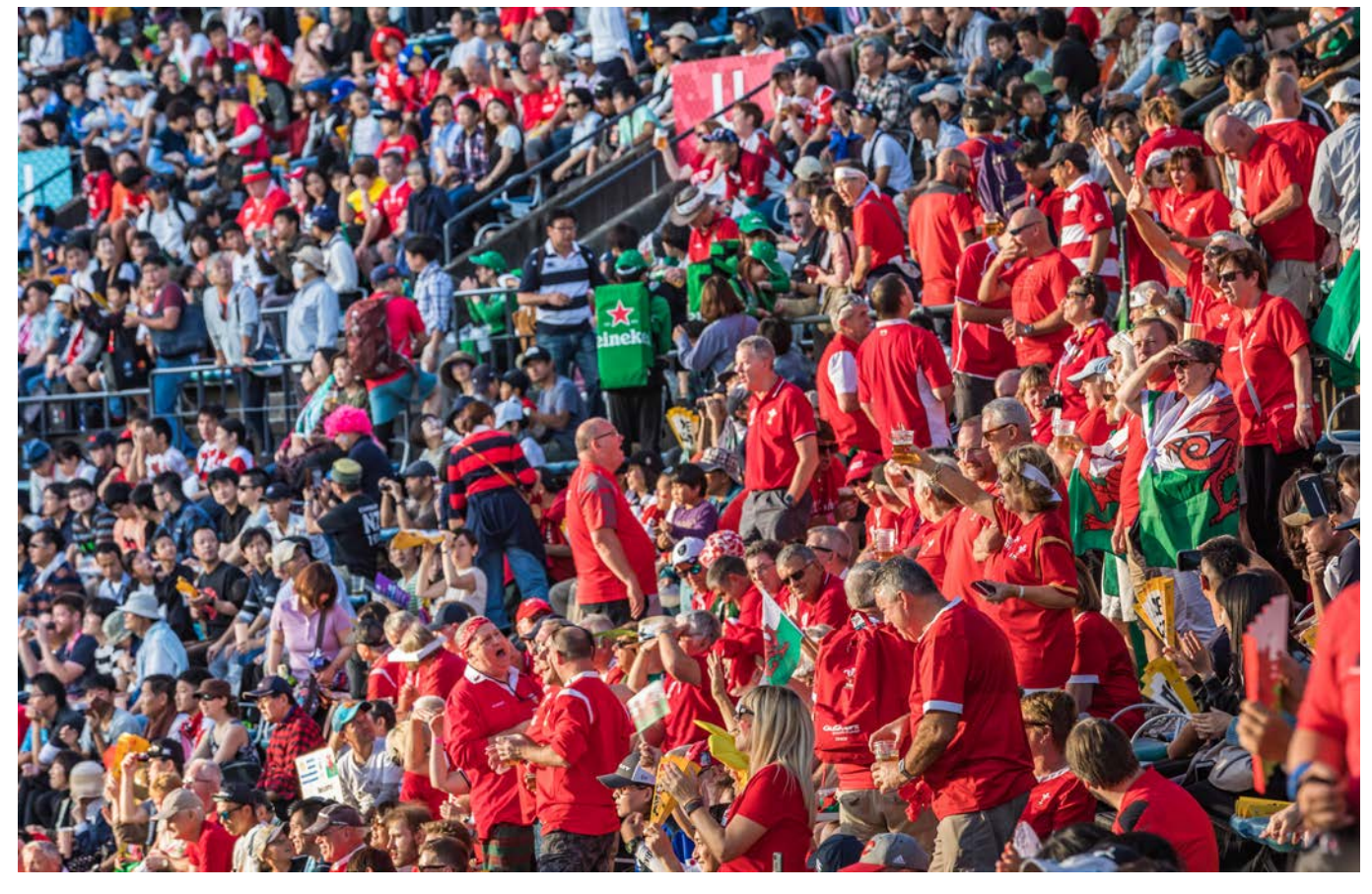
Wales vs. Uruguay, Rugby World Cup 2019, Kumamoto, Japan, October 2019.