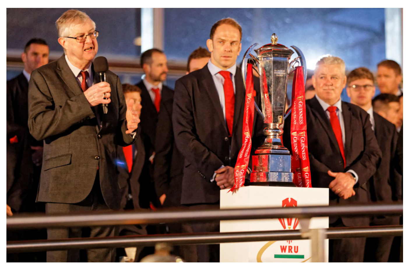
First Minister of Wales Mark Drakeford gives a speech next to Wales rugby team captain Alun Wyn Jones and head coach Warren Gatland during the celebration for Wales' Six Nations victory at the National Assembly for Wales on March 18, 2019 in Cardiff, Wales.

the 2019 Rugby World Cup in Japan was a great example of Wales on the world stage – who could have imagined a stadium full of 15,000 Japanese rugby fans singing the Welsh national anthem at a training session in Kitakyushu as Welsh businessmen met Japanese investors nearby?